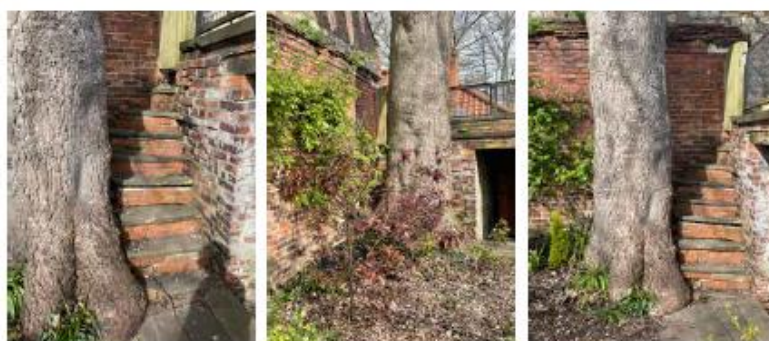
T1 - View looking north illustrating the tree (Sycamore) location and impact on the steps, wall (Grade II listed) and adjacent building.