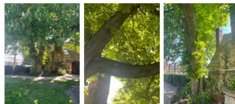
T2 - View looking south illustrating the proximity of the tree ( Aesculus hippocastanum )